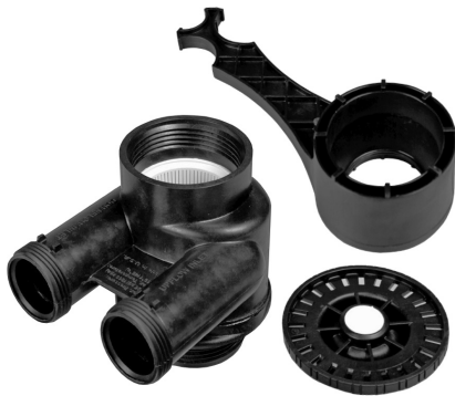
In-Out Tank Head with Fill Port (P/N LC-D1220-01)

In-Out Tank Heads are designed for downflow filter applications or upflow pH neutralization.